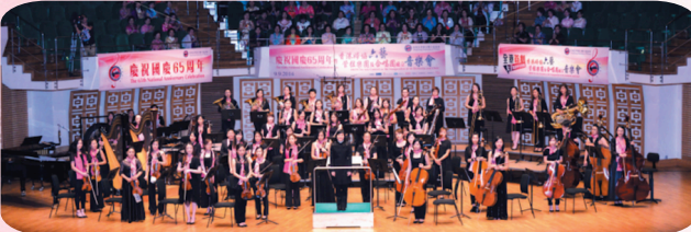
▲ 2014年9月 - 慶祝國慶65周年暨香港婦協六藝管弦樂團及合唱團成立音樂會 The 65th National Anniversary Celebration cum HKFW Six Arts Concert for the Inauguration of its Orchestra and Choir