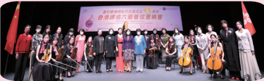
▲ 2022年7月 - 慶祝香港特別行政區成立25周年-香港婦協六藝管弦音樂會 HKFW Six Arts Orchestra Concert in celebration of the 25th Anniversary of the Establishment of the HKSAR