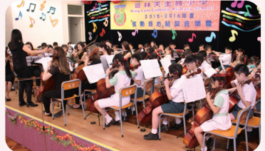
▲ 2015-2016年 - 「弦動我心」樂團體驗計劃 School Performing Arts in Practice Scheme: "Music of the Heart" Orchestra Experience Scheme