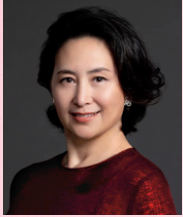
何超瓊女士 Ms. Pansy Ho, S.B.S., JP