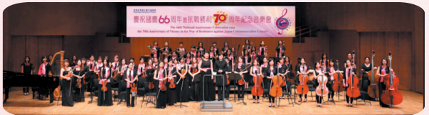
▲ 2015年9月 - 慶祝國慶66周年暨抗戰勝利70周年紀念音樂會 The 66th National Anniversary Celebration cum The 70th Anniversary of Victory in the War of Resistance against Japan Commemoration Concert