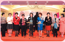
◀ 2014年3月 - 慶祝三八婦女節暨香港婦協六藝管弦啟動禮 International Women's Day Celebration cum HKFW Six Arts Orchestra Kick off Ceremony