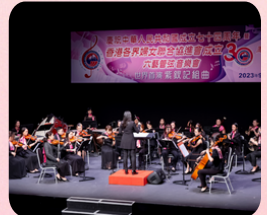
▶ 2023年9月 - 慶祝中華人民共和國成立七十四周年暨香港各界聯合協進會成立30周年六藝管弦音樂會 Six Arts Orchestra Concert in Celebration of the 74th Anniversary of the People's Republic of China cum the 30th Anniversary of Hong Kong Federation of Women