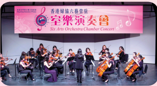
◀ 2016年11月 香港婦協六藝管 弦室樂演奏會 HKFW Six Arts Orchestra Chamber Concert