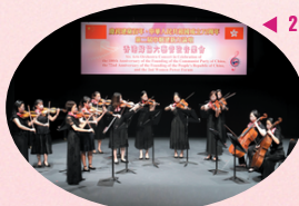
◀ 2021年10月 - 慶祝建黨百年、中華人民共和國成立72周年、第二屆巾幗建新力論壇 - 香港婦協六藝管弦音樂會 Six Arts Orchestra Concert in Celebration of the 100th Anniversary of the Founding of the Communist Party of China, the 72nd Anniversary of the Founding of the People's Republic of China, and the 2nd Women Power Forum