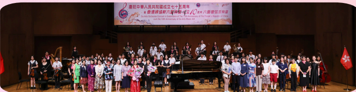
◀ 2024年9月 - 慶祝中華人民共和國成立七十五周年暨香港婦協新六藝樂藝成立10周年六藝管弦音樂會 Six Arts Orchestra Concert in Celebration of the 75th Anniversary of the People's Republic of China cum the 10th Anniversary of Six Arts Music Art