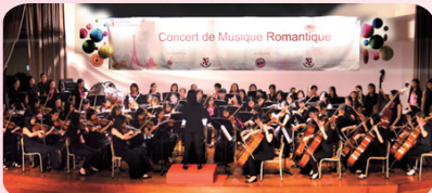
▲ 2016年5月 - 「法國五月」藝術節浪漫法國音樂會 Le French May - Concert de Musique Romantique