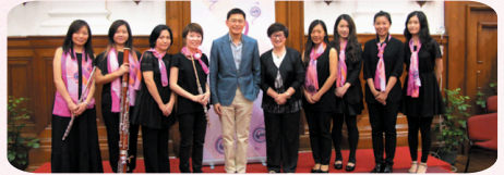
▲ 2014年7月 - 與香港大學聯合舉辦「音樂聚會」音樂會 「Music Rendezvous」 - HKU Summer Programme