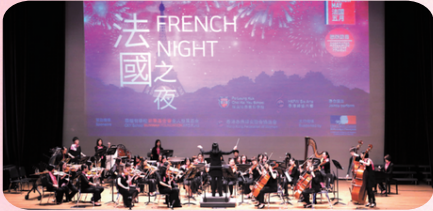
◀ 2014年5月 「法國五月」藝術節法國之夜音樂會 Le French May - French Night